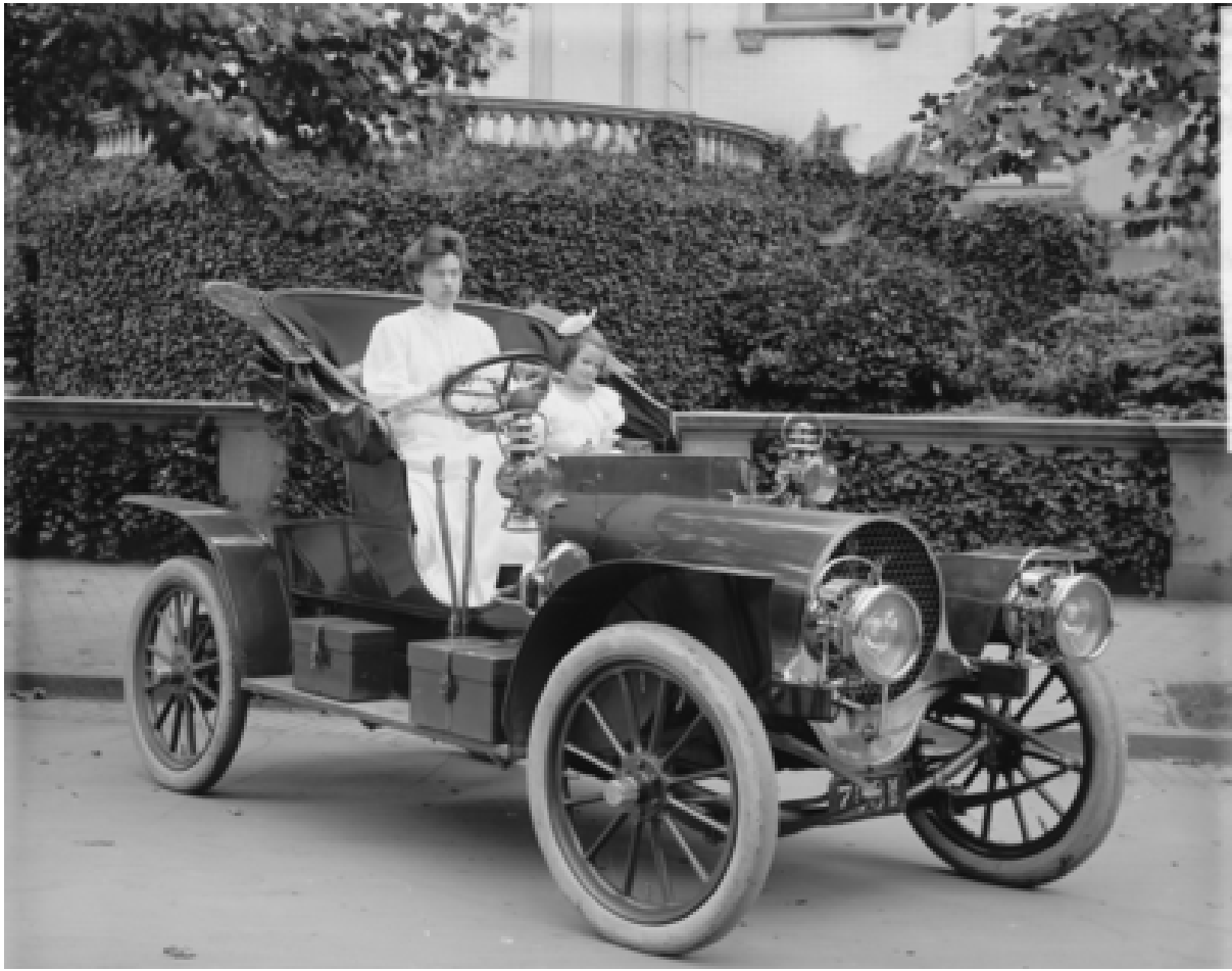
Figure 1: 1907 Franklin Model D roadster. Photograph by Harris & Ewing, Inc. [Public domain], via Wikimedia Commons. ( https://goo.gl/VLCRBB ).

Notice how it is formatted somewhat differently in the displaymath environment. Now, we'll enter an unnumbered equation: