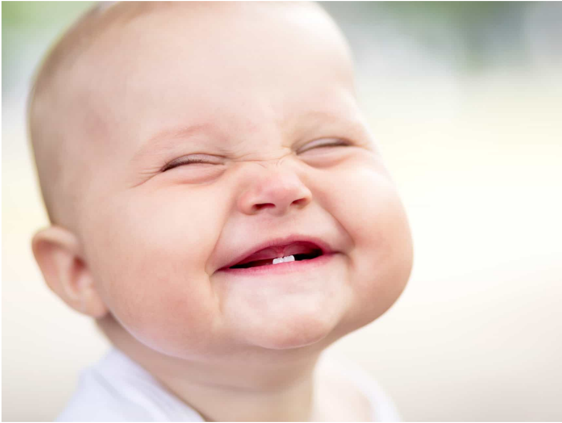
Figure 1.2.1: Intelligent sensor architecture