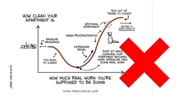
Figure 1: This figure lacks the axes tick labels and units of measurement. We kindly request you to provide not just axes labels but also axes measurements and units of measurements.

Humour aside, please also avoid the following.