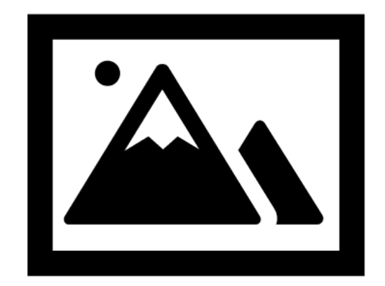
Figure 1: This is an example figure.

<sup>45</sup> that stage, figures should be supplied as Adobe Portable Document Format (PDF), PostScript (PS),