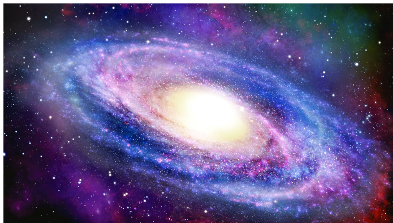
Fig. 6.1 Sample Picture of Universe

For example, The universe is immense and it seems to be homogeneous, in a large scale, everywhere we look at.