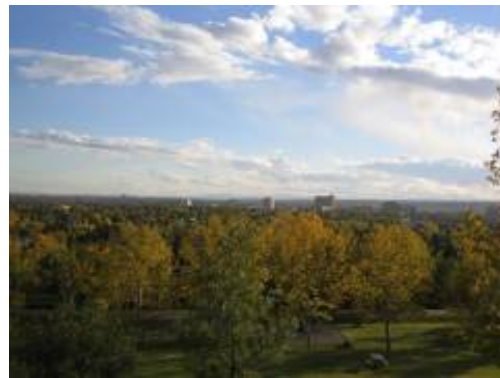
(b) Pan ma signo.