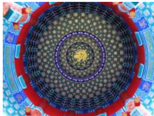
(d) Titulo debitas.