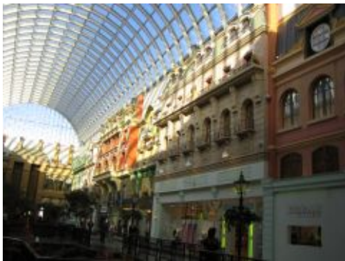
(a) Asia personas duo.