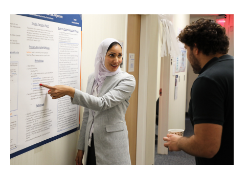
Figure 2.2: Caption of Figure 1.